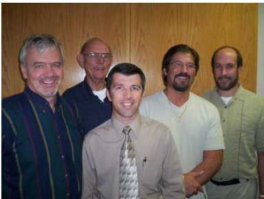
CRFR board in 2005