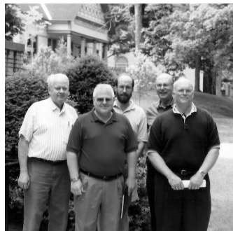
CRFR board in 2002

The original board members of CRFR took up the challenge to meet our primary mission goal outlined by Christ's final command-- To share the Gospel to the ends of the earth--and for them specifically, through the provision of Christian radio programming to Russian-speaking peoples across the former Soviet Union.