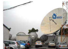
NLR uplink facility at RRsat in Tel Aviv, Israel

Cost of this global radio network: $20,000 per month