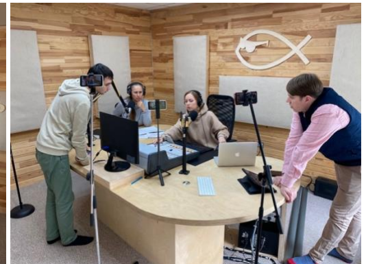
Studio B: 2 nd On air