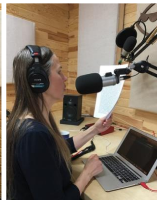
Studio D: production