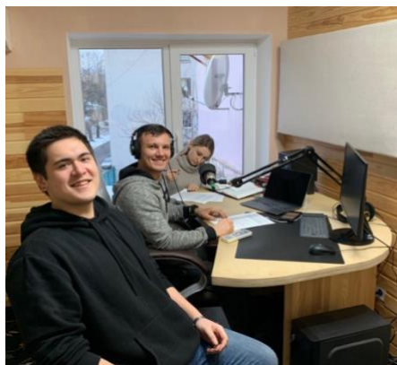
Studio E: production