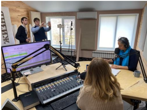
Studio A: Main On air