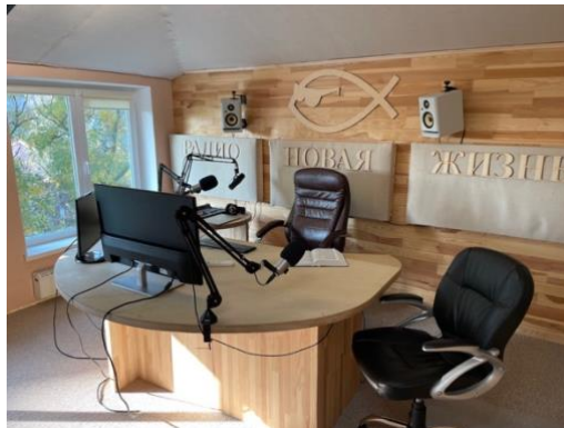
Studio C: 3 rd On air