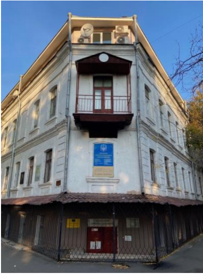
NLR on top floor of the Christian Economic & Humanitarian University