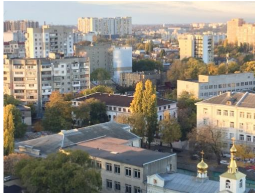
NLR building in center of photo: Built in the early 1800s as ministry housing for an Orthodox Cathedral ...eventually torn down by the Soviets