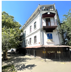
Morning after the attack

In our last newsletter, we asked for prayer that the Lord would protect our operations from the bombs headed our way. God answered on August 14th at 2:12 am when a missile hit near the New Life Radio (NLR) facility with the resulting shockwave blowing out windows throughout our building.